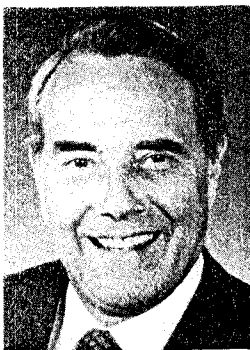
BOB DOLE Republican

(This information furnished by Buchanan for President.)