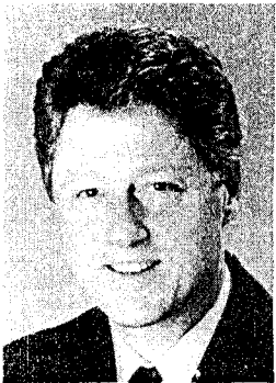
BILL CLINTON Democrat

OCCUPATION: President of the United States