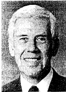
RICHARD G. LUGAR Republican

(This information furnished by Alan Keyes for President '96.)