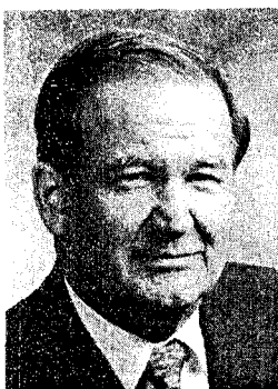
PATRICK J. (PAT) BUCHANAN Republican

(This information furnished by Alexander for President, Inc.)