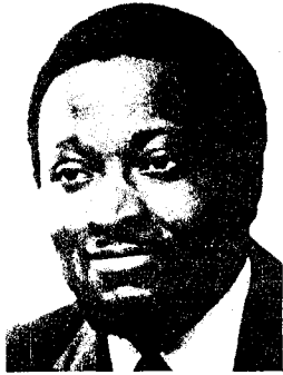
ALAN L. KEYES Republican

OCCUPATION: Author and former Ronald Reagan official.